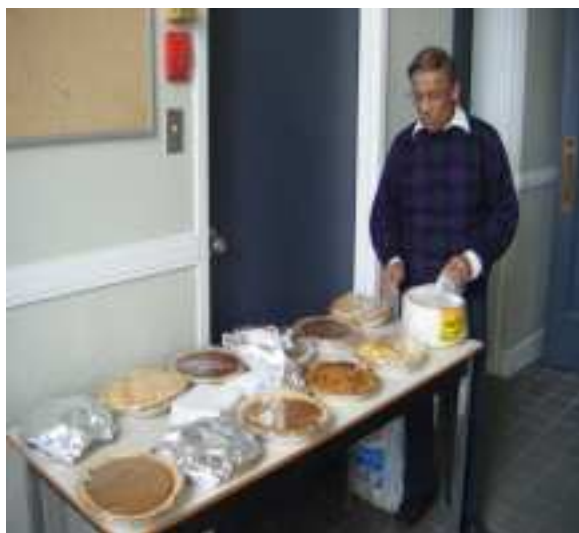
Pi Day 2008

A survey of the group of homotopy classes of homotopy self equivalences of a space