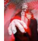
Pictures of the Week Oct. 4-10, 2010

ANNOUNCEMENTS: Obituaries | Births | Cards | InMemoriams | Milestones