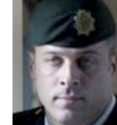
Soldier kicked out of Forces after shooting