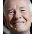
New governor general gives his view of the job